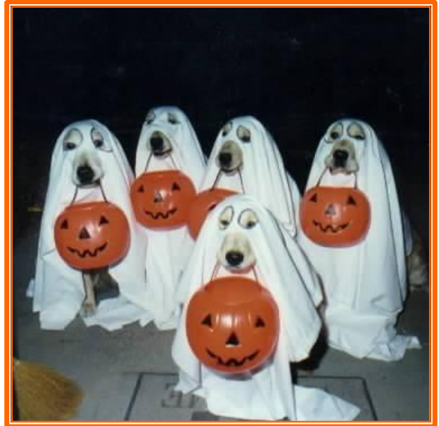
TRICK OR TREAT!

You may also be interested in other fact sheets from Dogs Trust which can be found at www.dogstrust.org.uk